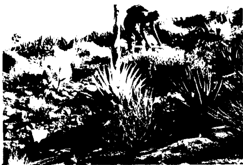
FIGURE 3. Photograph showing segment of rotted granitic floor of Indian Campsite paleovalley overlain by Eocene Ballena Gravels.

The McCain Spring paleovalley is up to 600 meters (2,000 feet) across and 2,300 meters (7,500 feet) long, is carved into batholithic rocks and also trends northwesterly (Figures 2 and 4). One long, well exposed paleovalley wall segment along the southern margin of the McCain Spring paleovalley trends N38°W. The projection of the northwest-trending McCain Spring paleovalley across Harper Flat to the prominent hill on its northern border (on Whale Peak