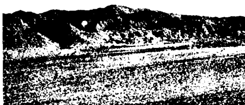
FIGURE 4. View southeastward across Harper Flat to northwestern terminus of the McCain Spring paleovalley shown in Figure 2. Note paleovalley carved into granitic basement (Spheroidal boulder outcrop) with steep wall on left and gently sloping wall and floor on right. Paleovalley is filled with Eocene and younger conglomerates; outcrops near floor and walls are eocene Ballena Gravels. Paleovalley floor is obscured in left-central portion by hill of Neogene conglomerate.

Preserved segments of the McCain Spring paleovalley walls and base expose lags of large Poway thuyolite and quartzite boulders lying on or against rotted plutonic rocks. Gravel specimens include a record long diameter of 84 centimeters measured on a gray Poway rhyolite clast. At the southwestern end of this paleovalley the preserved wall is 54 meters (175 feet) high and at the northeastern end, the wall is 160 meters (520 feet) high. The paleovalley is filled locally with Eocene Ballena Gravels but also is infilled in its upper parts by younger conglomerates deposited by smaller rivers which reoccupied the Eocene valley. These later streams eroded into the Eocene sedimentary fill and deposited gravels